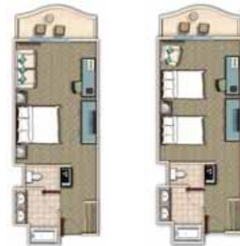
DELUXE/PREMIUM DELUXE OCEAN